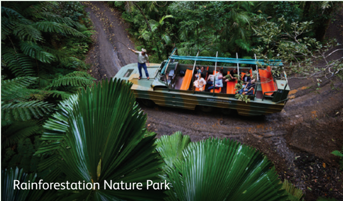
Rainforestation Nature Park