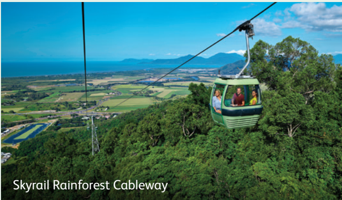
Skyrail Rainforest Cableway